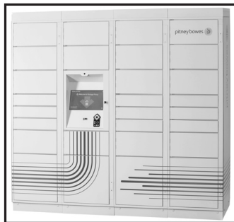
PB Intelligent Lockers

DESCRIPTION: ParcelPoint Smart Lockers from Pitney Bowes are the simple, modern solution to manage evolving package, mail and asset delivery demands. They increase efficiencies while providing a safe, secure, convenient delivery experience. With preconfigured and customizable locker designs available, we have a solution to fit your specific volume, space, layout and workflow requirements. Plus, our smart lockers seamlessly integrate with receiving software, including SendSuite® Tracking solutions, ensuring you receive and deliver with ease.