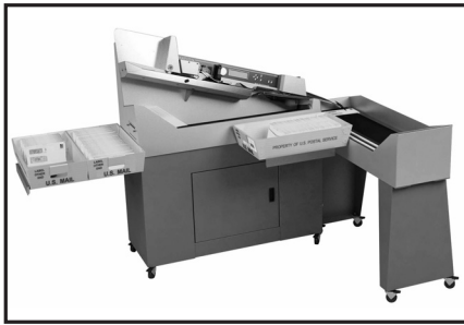
Omatation 306 Series Letter Openers

CONTACT: For more information call 877-682-7687 or visit Pitney Bowes at PitneyBowes.com .