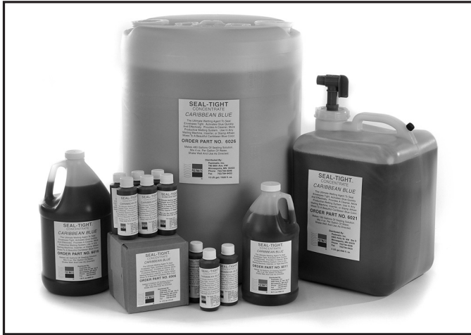
Postmatic Seal-Tight Concentrate

COMPANY: Postmatic, 9405 Holly St NW Ste D, Minneapolis, MN 55433 Phone: (763)-784-6046. Email: info@postmatic.net Contact: Sales. Web: www.postmatic.net .