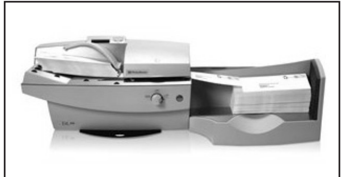
DL Series Letter Openers