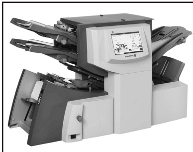
Relay® 4500 Folder Inserter

RELAY® 4500 MID VOLUME FOLDER INSERTER: The Relay 4500 tabletop inserter makes it easy to automatically fold and insert important recurring mailings.