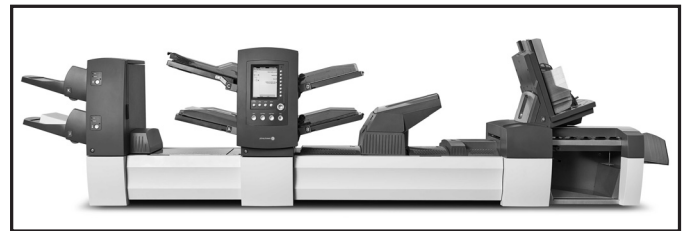
Relay® 7000 Folder Inserter

RELAY® 7000 MID TO HIGH VOLUME TABLETOP FOLDER INSERTER: The Relay 7000 can fold, insert and seal up to 5,400 pieces per hour with a monthly throughput of up to 120,000 envelopes per month. It brings a standard load-on-the-fly high capacity envelope feeder which can hold up to 500 envelopes. Letters and flats can be processed in the same job with counts of up to 25 pages inserted into flat envelopes. Higher volume mailers can add up to 2 high capacity sheet feeders, each with a capacity of up to 2,000 pages. The Relay 7000's optional file control integrity is the proven Pitney Bowes file-based processing technology that goes beyond traditional OMR or 1D and 2D barcodes scanning by using a Reference File to control the folding and inserting process. You can track not only what pages are being folded and inserted, but also which specific pages are intended for each individual customer, giving you the capability to recreate a mailing event at a personalized recipient level.