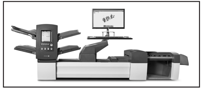
Relay® 5000 Folder Inserter

RELAY® 5000 MID VOLUME FOLDER INSERTER: The Relay 5000 brings our flagship tabletop inserting platform to mid volume mailers to bring you increased speed, flexibility and precision. This inserter folds, inserts and seals up to 62,500 a month with throughput of 4,000 envelopes per hour. We know your customers' privacy and security is critical. The optional file control is a proven Pitney Bowes technology version of file-based processing that goes beyond traditional OMR or 1D and 2D barcodes scanning by using a Reference File to control the folding and inserting process. You can track not only what pages are being folded and inserted, but also which specific pages are intended for each individual customer, giving you the capability to recreate a mailing event at a personalized recipient level. Achieve greater levels of accuracy, security and speed with the Relay 5000 inserting system.