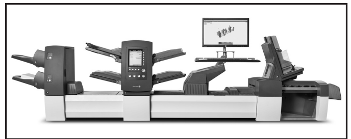
Relay® 8000 Folder Inserter

RELAY® 7000 MID TO HIGH VOLUME TABLETOP FOLDER INSERTER: The Relay 7000 can fold, insert and seal up to 5,400 pieces per hour with a monthly throughput of up to 120,000 envelopes per month. It brings a standard load-on-the-fly high capacity envelope feeder which can hold up to 500 envelopes. Letters and flats can be processed in the same job with counts of up to 25 pages inserted into flat envelopes. Higher volume mailers can add up to 2 high capacity sheet feeders, each with a capacity of up to 2,000 pages. The Relay 7000's optional file control integrity is the proven Pitney Bowes file-based processing technology that goes beyond traditional OMR or 1D and 2D barcodes scanning by using a Reference File to control the folding and inserting process. You can track not only what pages are being folded and inserted, but also which specific pages are intended for each individual customer, giving you the capability to recreate a mailing event at a personalized recipient level.