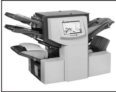
Relay® 3500 Folder Inserter

RELAY® 2500/3500 LOW-TO-MID VOLUME FOLDER INSERTERS: The Relay 2500/3500 inserters bring a fast, reliable tabletop folding and inserting platform to low-to-mid volume mailers, so you