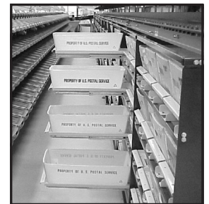
Sorter Tray Racks