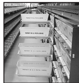
Sorter Tray Racks