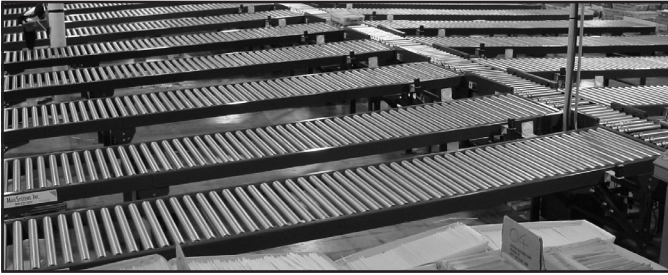
Mail Automation Inc.'s Mail Tray Conveyor Systems

Our product lines encompass both commercial and USPS applications. The company provides customized Tray Management Systems for First Class, Standard letters and flats. It provides standardized product lines as well as custom solutions that utilize conveyors to move trays, parcels, and flats along processing and sorting schemes to final dispatch.