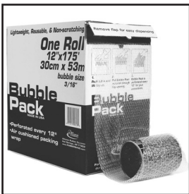
Air Bubble Protective Wrap

Air Bubble Protective Wrap: Air Bubble Protective Wrap is ideal for packaging fragile items; Recyclable; Easy to use; Perforated every 12" to eliminate waste.