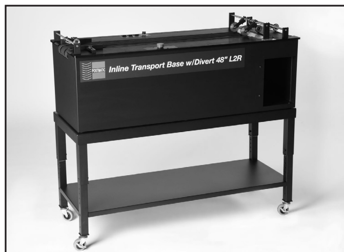
Postmatic Inline Divert System

CONTACT: For more information, call 770-427-4203 or email info@kirkrudy.com .