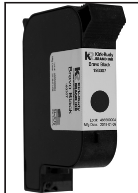
Kirk-Rudy Brand ink cartridges.

COMPANY: Kirk-Rudy, Inc., 125 Lorraine Parkway, Woodstock, GA 30188. Key Contact: Sales Email: info@kirkrudy.com . Phone: 770-427-4203.