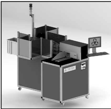
Tritek Compact Elite Sorter

COMPACT ELITE: The Compact Elite is designed for email processing and imaging. The scan area enables complete front and back side imaging. These images are stored, time and date stamped for records retention or email delivery.