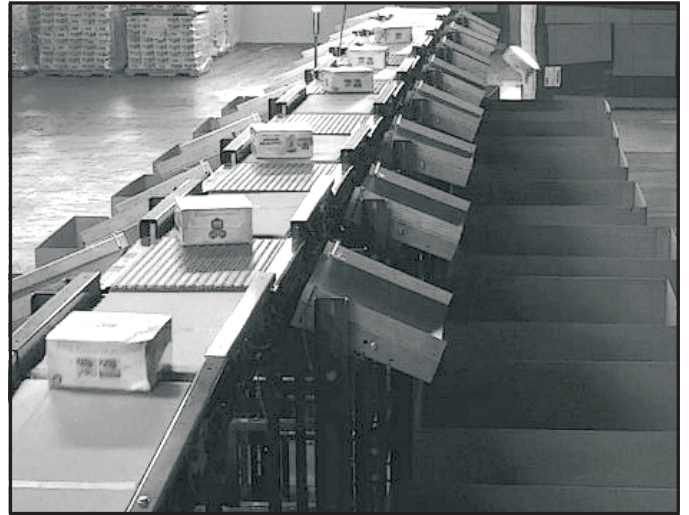
MAI Parcel Handling Sortation Systems

CONTACT: For more information, call 888-832-4902 or email info@fluencemail.com or visit fluenceautomation.com .