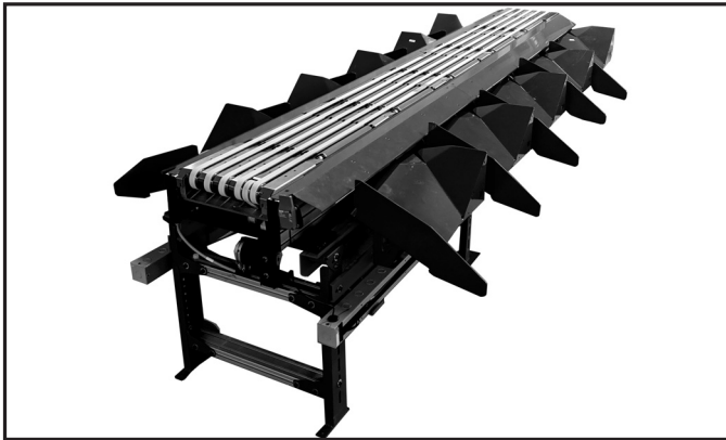
Fluence Smalls Parcel Sorter (SPS)

CONTACT: For more information call 1-800-350-6450 or email sales@eii-online.com .