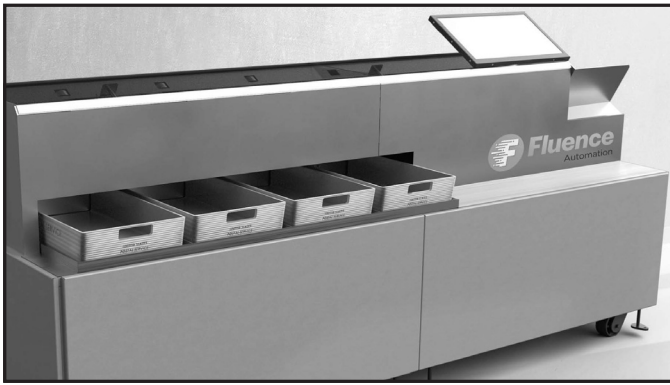
Fluence Summit Vote-By-Mail Sorter