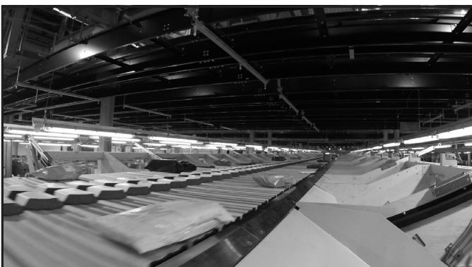
NPI Xstream in operation

CONTACT: For more information, call 888-821-SORT or email sales@npisorters.com.