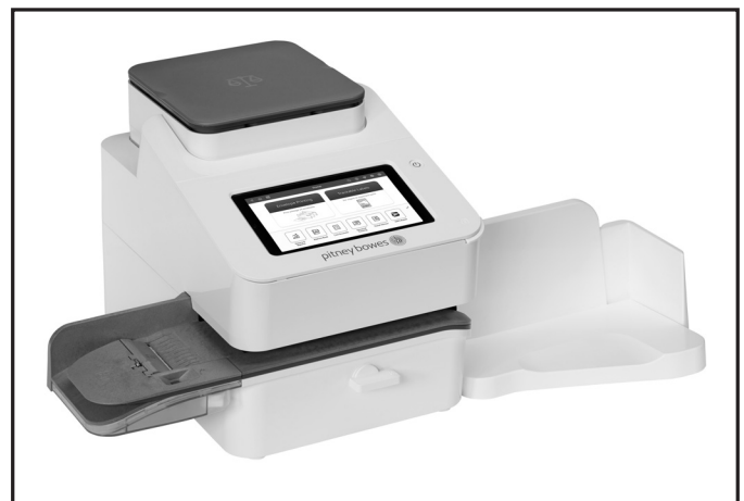
Pitney Bowes SendPro® C Lite