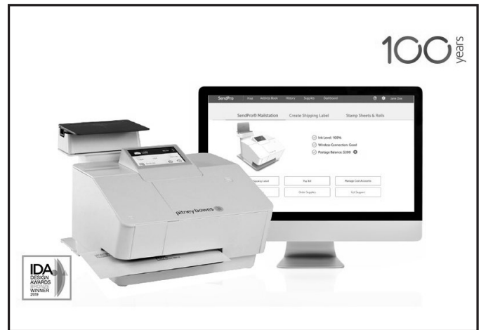
Pitney Bowes SendPro Mailstation