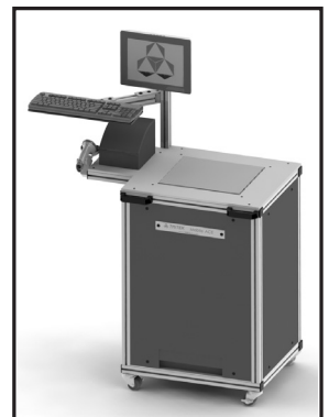
Tritrek ACE Workstation

OUTGOING MAIL/PARCELS: When used for presorting ACE performs: 1) USPS manifesting / weighing; 2) Prints label for each processed