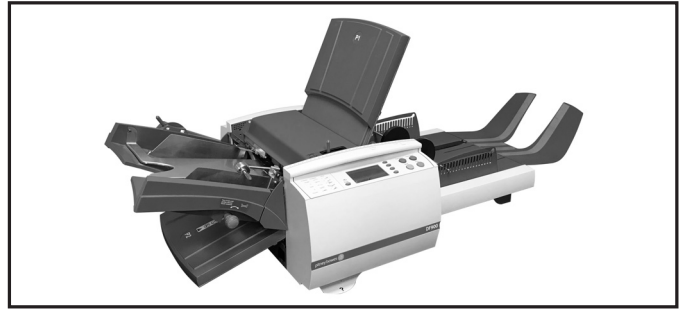
Pitney Bowes DF900 Folding System

DF800 FOLDING SYSTEM: The DF800 can fold up to 13,000 pieces per hour. This single compact system handles many folding needs. Its small footprint allows you to increase productivity by eliminating manual folding almost anywhere in your office. You can choose from 7 standard folding options, set up jobs in no time using built-in wizards and preset and set up to 20 jobs, making it easy for anyone to operate. The DF800 folder handles paper weights from 14 lbs. to 32 lbs., and paper sizes from 5"x5" to 9"x16". Choose the ideal fold for your job from seven popular options: single-fold, double-fold, letter or C-fold, offset C-fold, Z-fold, offset Z-fold or gate-fold.