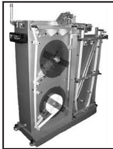
KR565 Splicing Unit

KR 565 LABEL SPLICING UNIT: Designed to provide nonstop, uninterrupted labeling when used with