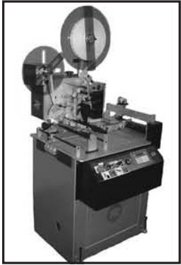
KR440 Mini Tabber

Kirk-Rudy tabbers. The continuous feed dual unwind acts as a stand-alone standard loose-loop powered unwind unit. When the supply roll unwinds to a certain level, a sensor activates a warning light and signals the drive to feed the remaining labels into a holding bin. The second roll of labels is then spliced to the end of the web as the labels in the bin are consumed.