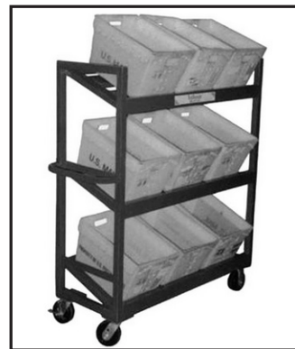
The TrayTruker (left) and TubTruker from Mail Automation, Inc.

trays. Accessible from either side. Durable steel construction. It measures 46" long x 71" high x 25" wide. Use different colors to differentiate mail.