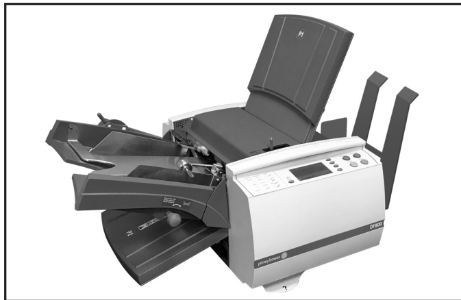
Pitney Bowes DF800 Folding System

CONTACT: For more information, call 770-427-4203 or email info@kirkrudys.com .