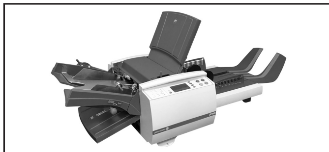
Pitney Bowes DF900 Folding System

DF800 FOLDING SYSTEM: The DF800 can fold up to 13,000 pieces per hour. This single compact system handles many folding needs. Its small footprint allows you to increase productivity by eliminating manual folding almost anywhere in your office. You can choose from 7 standard folding options, set up jobs in no time using built-in wizards and preset and set up to 20 jobs, making it easy for anyone to operate. The DF800 folder handles paper weights from 14 lbs. to 32 lbs., and paper sizes from 5"x5" to 9"x16". Choose the ideal fold for your job from seven popular options: single-fold, double-fold, letter or C-fold, offset C-fold, Z-fold, offset Z-fold or gate-fold.