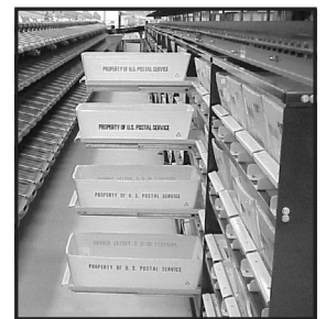
Sorter Tray Racks