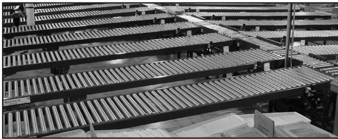
Mail Automation Inc.'s Mail Tray Conveyor Systems