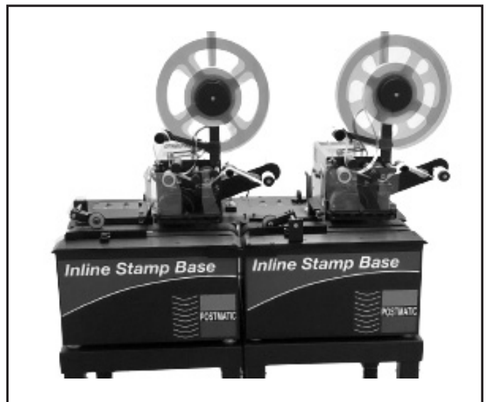
Postmatic Inline Stamping System

COMPANY: Postmatic Inc., 9405 Holly St NW Ste D, Minneapolis, MN 55433 Phone: (888)-784-6046. Email: info@postmatic.net Contact: Sales. Web: www.postmatic.net .