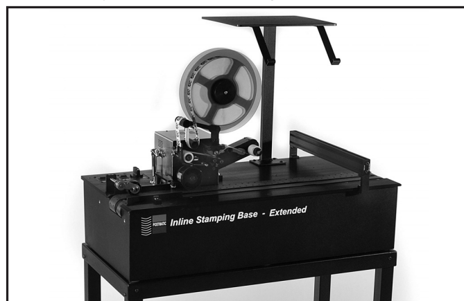
Postmatic Inline Stamp Affixing System

INLINE DIVERT SYSTEM: Postmatic has a complete line of Inline Divert Bases in lengths of 16", 24" & 48" long and available in Left to Right or Right to Left feed configurations. Handles up to 10x13 pieces and has Dry Contact, Electro-mechanical gate actuation. Great for use with Camera Systems or other controlling devices.