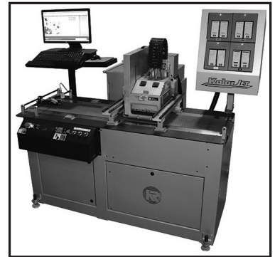
KRC500 Kolor Jet Printer

CONTACT: For more information, call 770-427-4203 or email info@kirkrud.com .