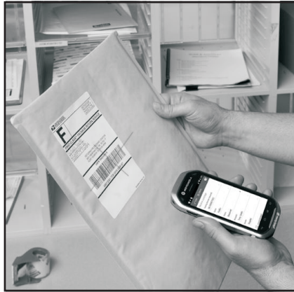
Pitney Bowes SendSuite® Tracking Online

SENDSUITE® TRACKING ONLINE: This cloud-based solution streamlines the logging, tracking and managing of incoming packages and