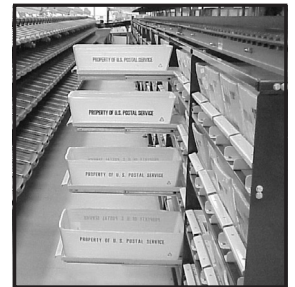
Sorter Tray Racks

DESCRIPTION: The PostalOne® System provides the capability to scan barcode labels, weigh mail trays and tubs, and print Dispatch & Receipt (D&R) labels for manual or automatic application (depending on configuration). D&R labels are created based on information exchanges through a USPS Transaction Concentrator (TC). PostalOne is designed for reliability and ease of use, while maintaining a low cost. PostalOne is available in Automated, Semi-Automated and Tabletop versions.