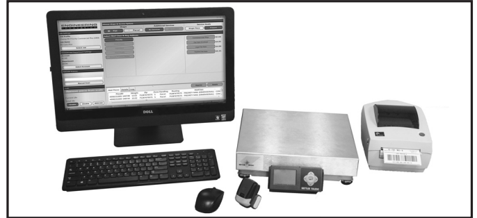
Engineering Innovation's Super Champ

CONTACT: To learn more about Tritek call 302-239-1638 or visit www.tritektech.com or email info@tritektech.com .