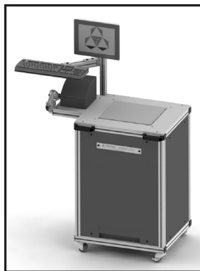
Tritek ACE Workstation

OUTGOING MAIL/PARCELS: When used for presorting ACE performs: 1) USPS manifesting / weighing; 2) Prints label for each processed