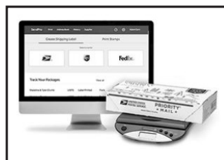
Pitney Bowes SendPro Online

gives senders access to choose the rate, delivery mode, and delivery date that best fits their needs. To learn more about SendPro Enterprise see pitneybowes.com/us/spe .