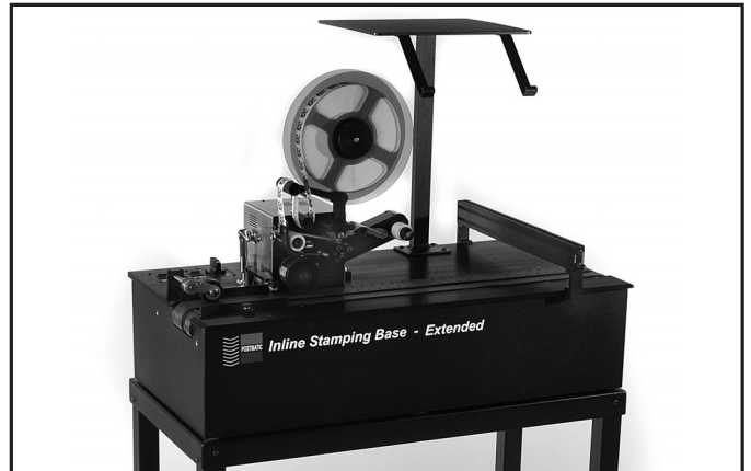
Postmatic Inline Stamp Affixing System

INLINE DIVERT SYSTEM: Postmatic has a complete line of Inline Divert Bases in lengths of 16", 24" & 48" long and available in Left to Right or Right to Left feed configurations. Handles up to 10x13 pieces and has Dry Contact, Electro-mechanical gate actuation. Great for use with Camera Systems or other controlling devices.