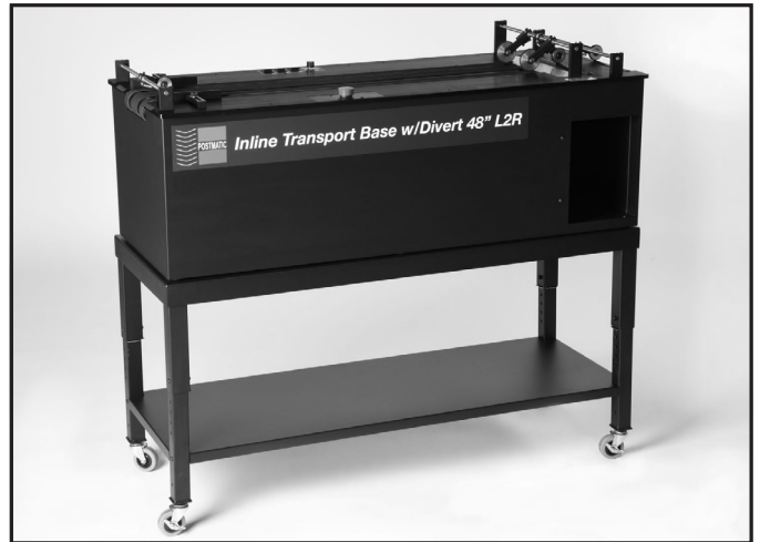
Postmatic Inline Divert System

COMPANY: Postmatic Inc., 9405 Holly St NW Ste D, Minneapolis, MN 55433 Phone: (888)-784-6046. Email: info@postmatic.net Contact: Sales. Web: www.postmatic.net .