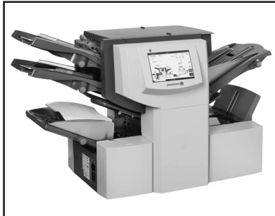
Relay® 3500 Folder Inserter

RELAY® 2500/3500 LOW-TO-MID VOLUME FOLDER INSERTERS: The Relay 2500/3500 inserters bring a fast, reliable tabletop folding and inserting platform to low-to-mid volume mailers, so you