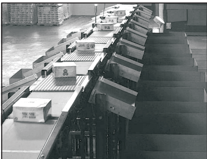
MAI Parcel Handling Sortation Systems

CONTACT: For more information, call 888-832-4902 or email info@fluencemail.com or visit fluenceautomation.com .