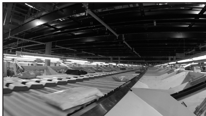
NPI Xstream in operation

CONTACT: For more information, call 888-821-SORT or email sales@npisorters.com .