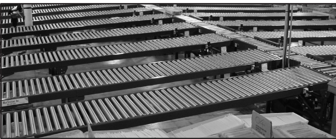
Mail Automation Inc.'s Mail Tray Conveyor Systems

Our product lines encompass both commercial and USPS applications. The company provides customized Tray Management Systems for First Class, Standard letters and flats. It provides standardized product lines as well as custom solutions that utilize conveyors to move trays, parcels, and flats along processing and sorting schemes to final dispatch.