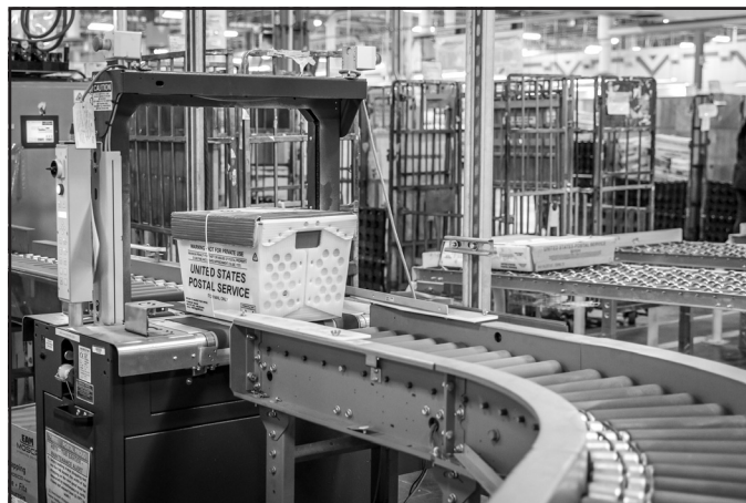
EAM-Mosca ROMP6B-Sonixs In-line Strapping Machine

ROM-FUSION Walk Up, Operator Cycled Strapping Machine: The ROM-Fusion walk-up operator-cycled strapping machine delivers the same performance and reliability you would expect from Mosca but at a more economical price. Featuring Mosca's DC brushless direct drive technology, this machine is best suited for mid-level strapping needs and provides the perfect combination of convenience and low-cost with reliability. The machine runs at a production rate of up to 55 bundles per minute. It is available in (3) track sizes to fit a variety of needs: 600mm x 500mm, 800mm x 600mm, 1250mm x 600mm and the ability to run in (3) common strap sizes, 5mm, 8mm and 12mm. The 600mm x 500mm arch is best suited for totes and bundles. It allows minimal room between tray and machine arch. The 800mm x 600mm is especially suited to strap all mail tray sizes and flat tubs. It allows ample room between trays and machine arch for easy and accurate strapping.