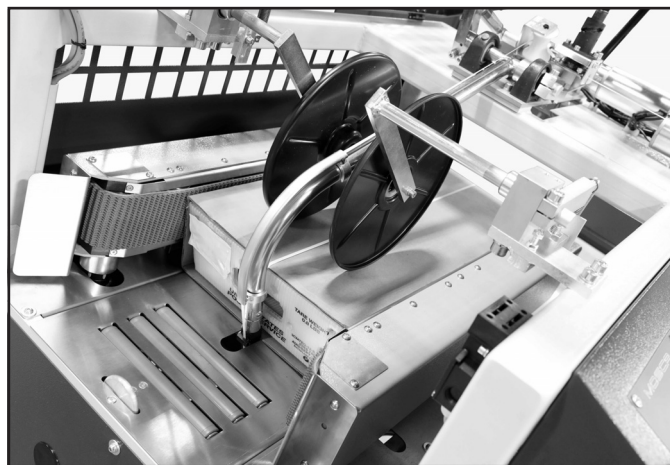
EAM-Mosca ROMP6B-Sonixs In-line Strapping Machine

PET strapping. The 600mm x 500mm arch is best suited for totes and bundles. The 800mm x 600mm is especially suited to accommodate and strap all mail tray sizes and flat tubs. It allows ample room between trays