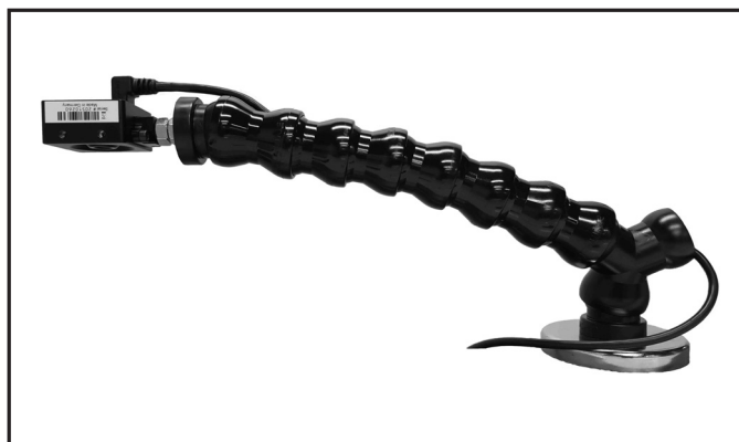
USB camera used in Clear Image Technologies Picture Perfect

CONTACT: For more information, contact BÖWE SYSTEC North America online at www.bowesystecinc.com .