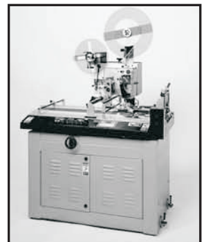
Kirk-Rudy KR540 Tabber

KR 540 TABMASTER: The KR 540 makes tabbing of paper products faster and easier than ever. A straight forward operator interface simplifies operator training and setup while industry standard motors and controls make the KR 540 simple to operate and economical to maintain. All major types of tabs as well as pressure-sensitive stamps and labels of various shapes and sizes can be placed on a wide variety of products. Right or left edge tabbing, bump turn attachments, wide and fan-folded label kits along with a folder interface conveyor option make the KR 540 a flexible system.