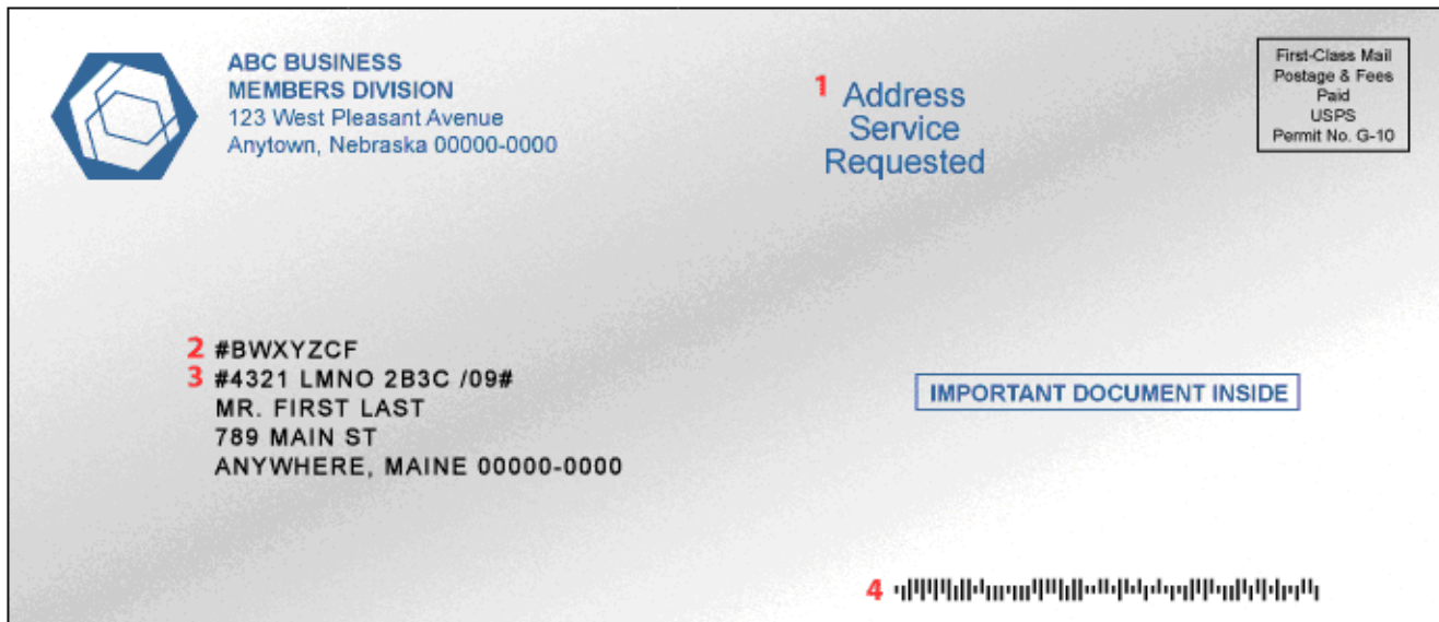
Exhibit 1: Traditional ACS Mailpiece

NOTE: Mail that is prepared for Traditional ACS requires a printed ancillary service endorsement.