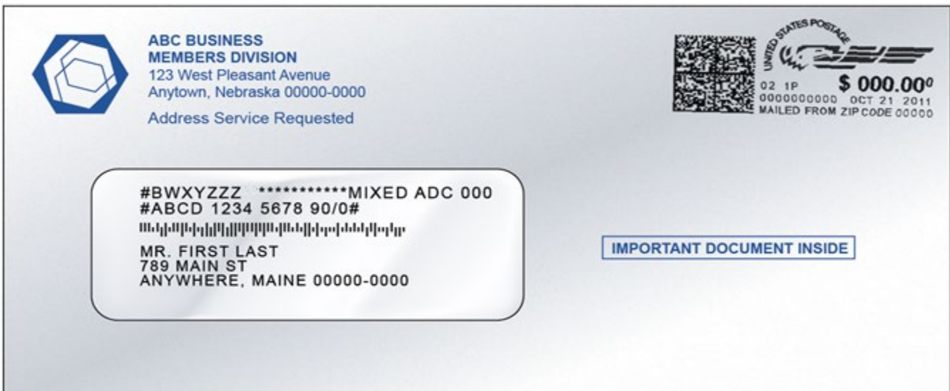
Exhibit 2: Window Envelope or Address Label with Traditional ACS

IMPORTANT NOTE: A traditional keyline is required to receive NIXIE notices. If you utilize an Intelligent Mail barcode for discounts only and continue to request Traditional ACS, the appropriate Service Type ID (STID) must be used in the IMB to request Traditional ACS. For a current list of the Traditional ACS Service Type IDs refer to the Table of Service Type Identifiers at this link: https://postalpro.usps.com/address-quality/ACS/AppendixA_STID_Details and https://postalpro.usps.com/service-type-identifiers/stdtable