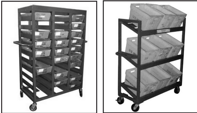
The TrayTruker (left) and TubTruker from Mail Automation, Inc.