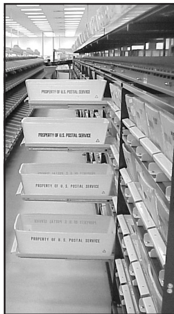
Sorter Tray Racks

COMPANY: Mail Automation, Inc., 310 Baltimore-Somerset Rd, Baltimore, OH 43105. Phone: 844-808-5454