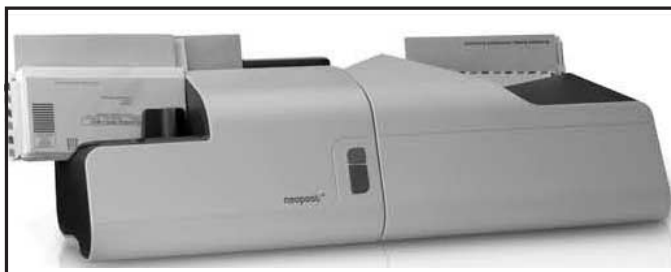
Neopost IM-16 Letter Opener

CONTACT: To learn more, visit www.agissar.com or call 1-800-627-8256 or email info@agissar.com .