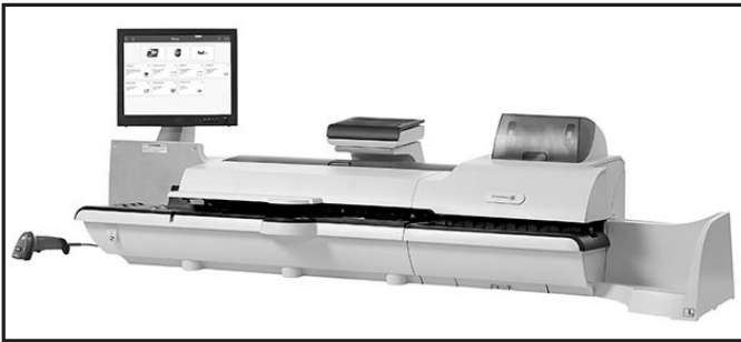
Pitney Bowes SendPro P1500 Mailing & Shipping System