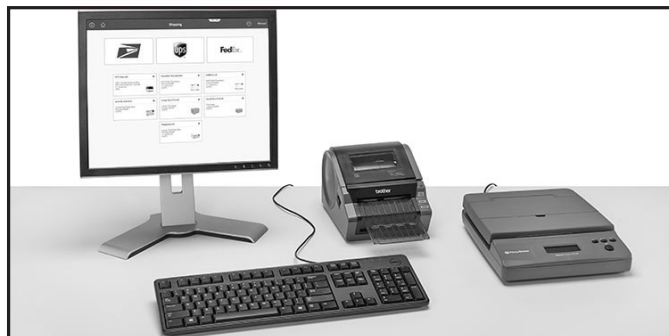
Pitney Bowes SendPro Online Software

CONTACT: For more information, call (800-636-7678) or click www.neopostusa.com .