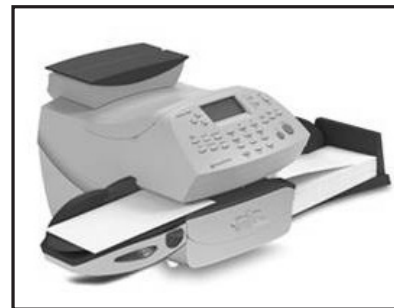
Pitney Bowes DM125

DM125™ DIGITAL MAILING SYSTEM: A compact, whisper-quiet, semi-automatic postage meter is designed for low-volume office applications. The system processes letters at up to 35 pieces per minute. For larger items, you can weigh mail on an integrated scale and print postage tapes including large flats, parcels and oversized packages. You can even track postage expenses for different accounts. Complement your DM125 with SendPro™ online shipping software to ship packages and save money with the major carriers.