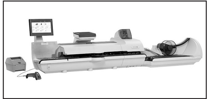
Pitney Bowes SendPro P2000 Mailing & Shipping System