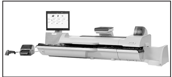
Pitney Bowes SendPro P3000 Mailing & Shipping System

when users can print their own as they go. The SendPro P1000 simplifies operations by integrating a shipping label printer. It offers a full range of non-WOW interfaced weighing options over 70 lbs., with processing speeds of up to 180 letters per minute. With an easy-to-use, intuitive color touch-screen interface, users can quickly and easily access all of their printing and mailing applications, making their operation run like clockwork.