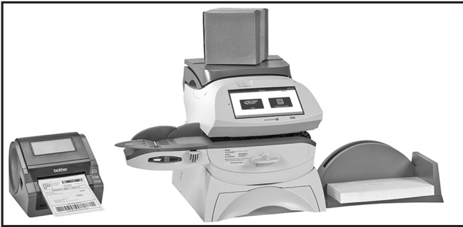
Pitney Bowes SendPro 300 Mailing & Shipping System