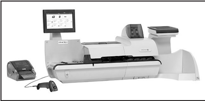
Pitney Bowes SendPro P1000 Mailing & Shipping System