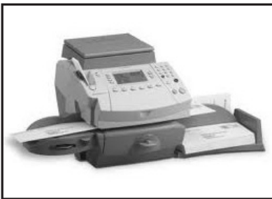
Pitney Bowes DM300

DM300™ DIGITAL MAILING SYSTEM: A quietly efficient, semi-automatic system designed for low to mid-volume mailers. The