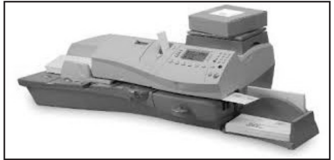
Pitney Bowes DM400 Digital Mailing System

DM400™ DIGITAL MAILING SYSTEM: A streamlined solution that provides performance and easy operation making it the perfect choice. Pitney Bowes' DM400™ Digital Mailing System improves productivity in a wide variety of office environments. The DM400 offers automatic feeding and processes mail at speeds of up to 120 pieces per minute. The QWERTY keyboard, integrated scale, accounting feature, time and date stamp and built-in tape strip feeder enhance the productivity of this solution. Complement your DM400 with SendPro™ online software for shipping packages with the major carriers.