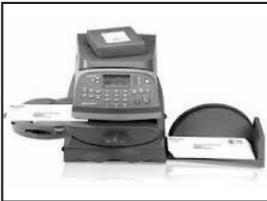
Pitney Bowes DM225

SendPro™ online shipping software to ship packages and save money with the major carriers. Designed for the small office, the SendPro 300 not only prints postage on your envelopes (up to 45 letters per minute), but also has the unique capability to ship packages through multiple carriers right from your postage meter. This compact system is digitally connected to ensure fast mail processing and print a compliant shipping label for whichever carrier you select. The system also keeps you up to date with automatic postal updates, low ink alerts, service warnings and diagnostic notifications.